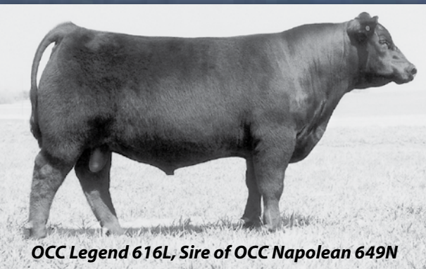
OCC Legend 616L, Sire of OCC Napoleon 649N

His sons are deep bodied, stout and well made. A sure fire heifer bull that breeds style, fleshing ability and muscle. His granddam is a full sister to Emblazon.